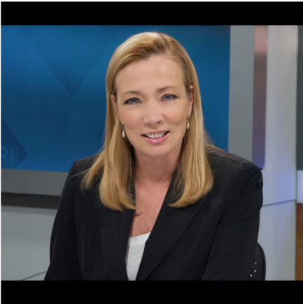
Here & Now