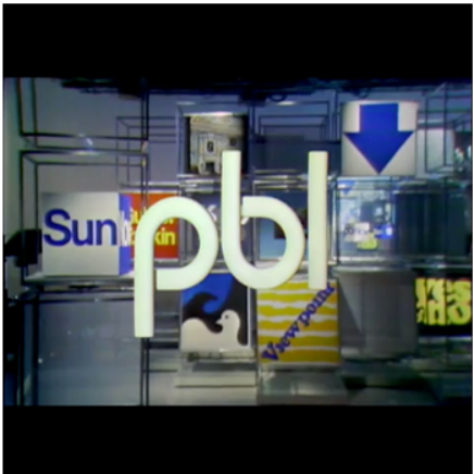
Public Broadcast Laboratory

The spring season brings with it new Special Collections to the AAPB, including a landmark series in early public broadcasting, local news and current affairs from Wisconsin, and a pioneering series in bringing early music to the listening public: